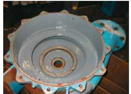
Complete coating with drinking water approved material (COMTEC 432).