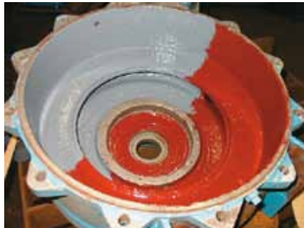
Second layer of coating