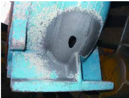
Worn casting with hole