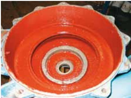
First layer of coating with drinking water approved material (COMTEC 432).